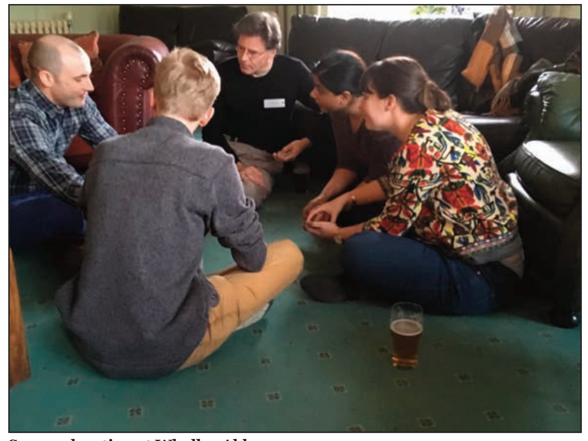
Some relaxation at Whalley Abbey.