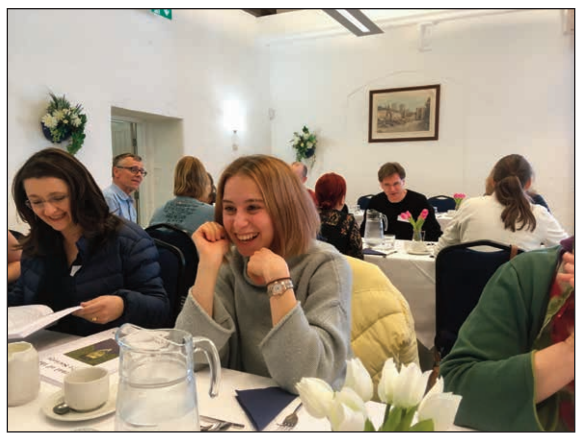
Whalley Abbey weekend.