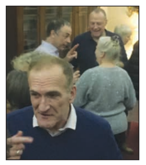
London Study Day.