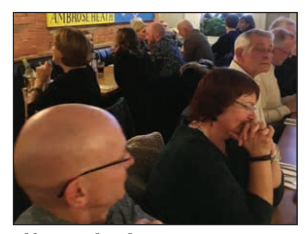
Delegates enjoying themselves at the Belfast Weekend.