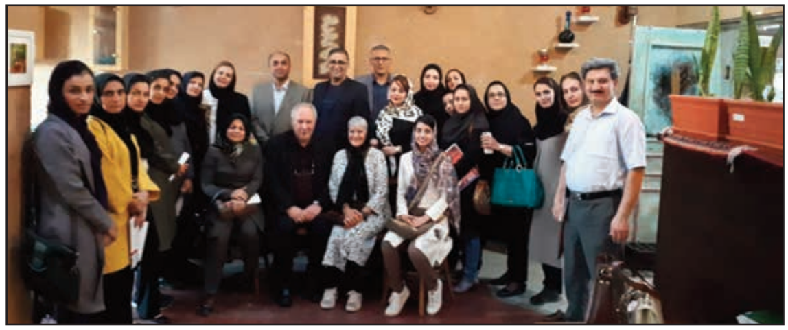
Delegates at the KermanWorkshop in October 2018.

cultures, described Iranian cultural reality as "jelly like" by which, I think, is meant, that there are movements, shifts and flexibility. In my view, this is the product of an ancient multi-ethnic nation with a linguistic sophistication and complex codes and protocols for interpersonal communication. The love of poetry seems to be ubiquitous and this is coupled with strong use of metaphor in every day speech. For example, an individual in one Balint Group described an emotional situation as being like "the sparks from Espand" (a herbaceous plant dried and burnt as part of a purification ritual) (Ref 1), or another individual said, "If your tears could speak, what would they say to you?".