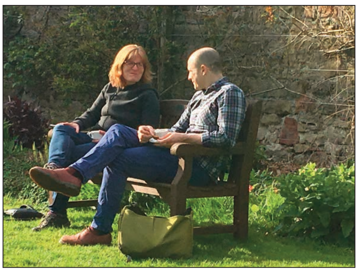
Delegates at Whalley Abbey relax in the grounds.